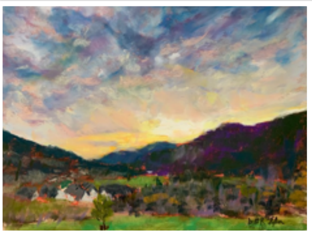
July & August, 2026